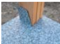
PRIOR TO INSTALL