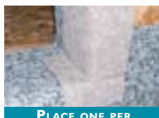
PLACE ONE PER SILL CORNER