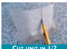
CUT UNIT IN 1/2 TO MAKE 2