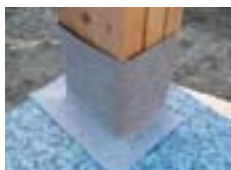
SINGLE UNIT PLACED